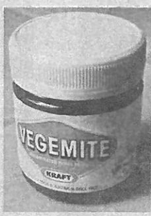
Jar of Vegemite